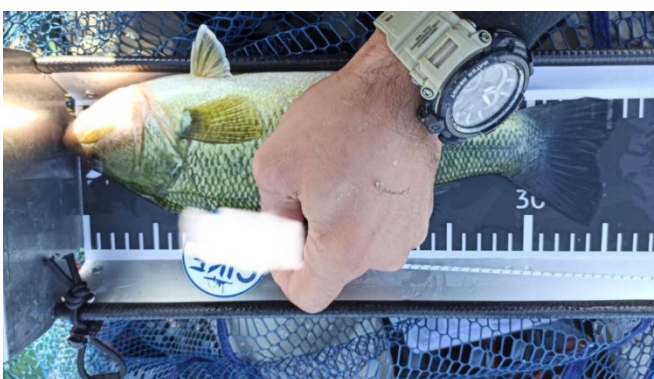
Fish placed upside down, dorsal fin must be facing upwards = Zero Score